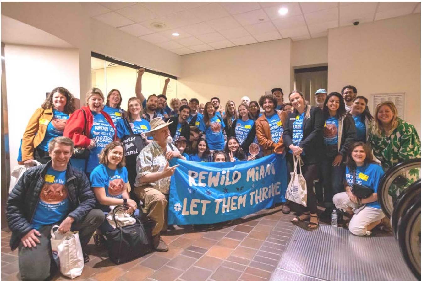
TAS friends and conservation partners attend the December 12 MDC BCC meeting to oppose the Miami Wilds theme park proposal and advocate for endangered species and imperiled Pine Rocklands habitat.

The Miami-Dade County commissioners on December 12 voted 9-1 to on December 12 withdraw a proposal that would have amended the lease agreement with Miami Wilds, LLC , effectively sinking the controversial themed water park and retail development plan that would have threatened endangered species near Zoo Miami.